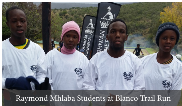
Raymond Mhlaba Students at Blanco Trail Run

Sparrows was invited to attend the Allcopy Publishers 20th birthday celebration on 3 September 2016. The organisation was afforded the opportunity to share information about what we do as well as demonstrate how their contributions have impacted our work. Allcopy has been a wonderful friend to our organisation.