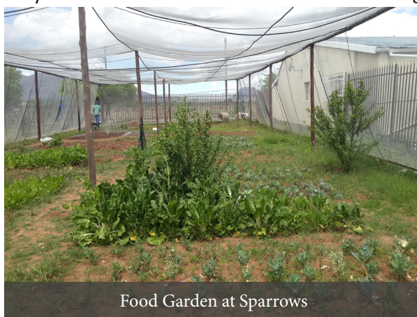
Food Garden at Sparrows