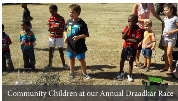
Community Children at our Annual Draadkar Race

Four Raymond Mhlaba learners participated in the Blanco Trail Run on 13 May. One of the girls won a weekend for 4 at Blanco. Thank you to Blanco for making their weekend so memorable.