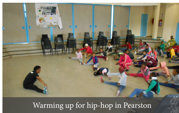
Warming up for hip-hop in Pearston

them help in the garden. We try our best to establish and nurture healthy relationships with the children in our care, since many of them are from a background where unhealthy relationships seemed the norm.