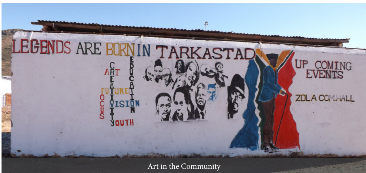
Art in the Community